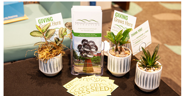
Giving Grows Here decorations to represent the exponential growth and impact of the Foothills Community Foundation in 2025