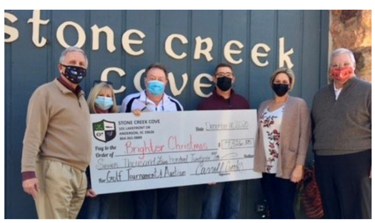
Stone Creek Cove Golf Tournament donates $7,276.00 to the Brighter Christmas Fund