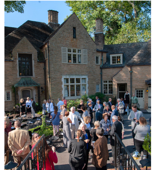
Foothills Community Foundation's Grant Event - October 10th, 2019