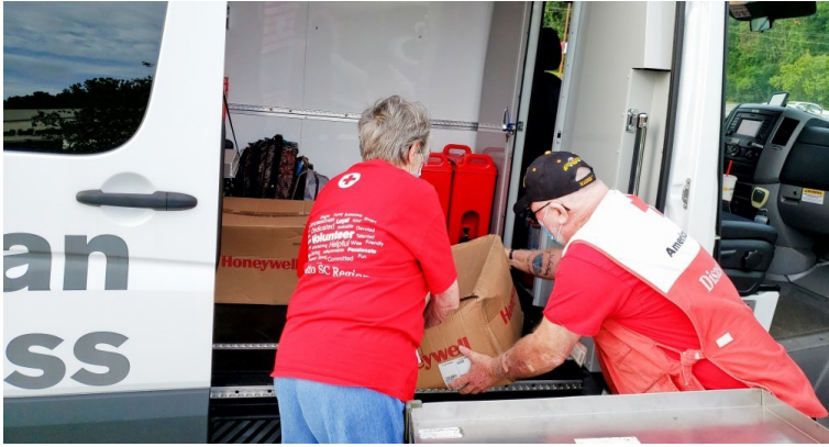
Unloading Disaster Relief Supplies